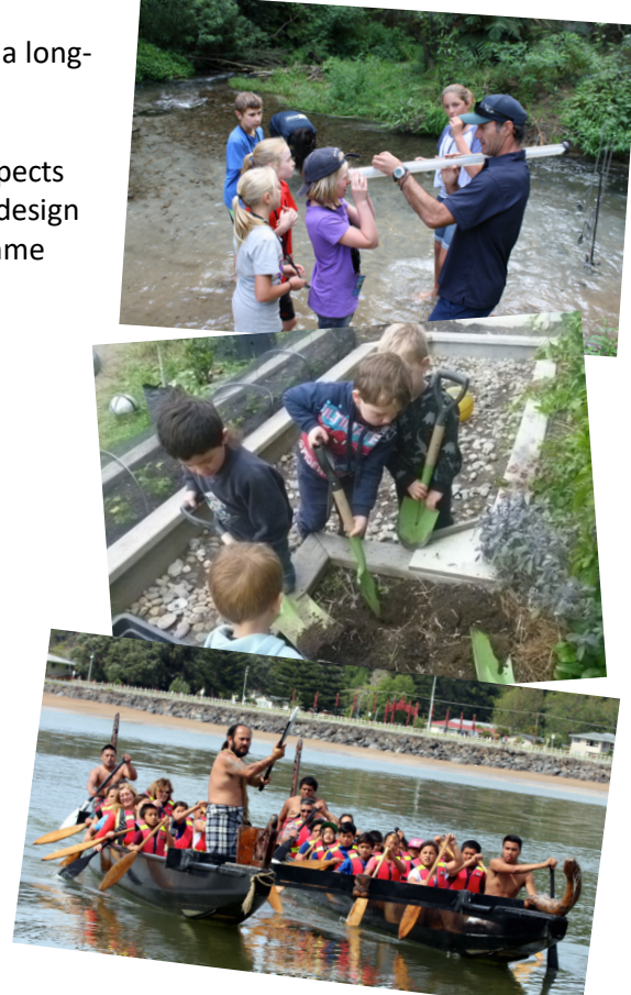
Teacher 2017 Census

We need to prepare students for their future sustainability is a no brainer, Enviroschools is the only comprehensive programme to address that.